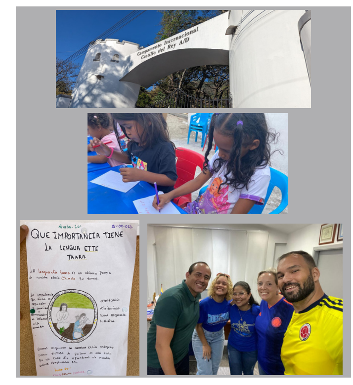
"Accept what IS, let go of what WAS, and have faith in what will BE"